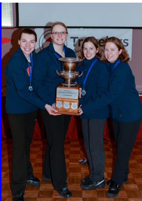
2016 PIC Women's Champs - Alaska (Fairbanks CC)

Bronze: Washington (Granite Club of Seattle)